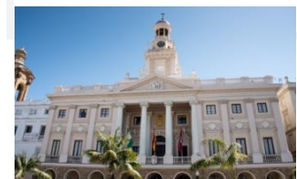
Cádiz Town Hall

Cádiz’s carnival is one of the best-known carnivals in Spain. Its main characteristic is humour - sarcasm, mockery and irony. The first references to the carnival of Cádiz that are known come from the sixteenth century. Next Cádiz’s carnival will be 8 th - 18 th February 2024.