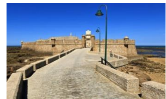
Castle of San Sebastian

Other monuments in Cádiz are the Castle of San Sebastián, Old Town hall, Cádiz Cathedral, San Francisco church, Falla Grand Theatre