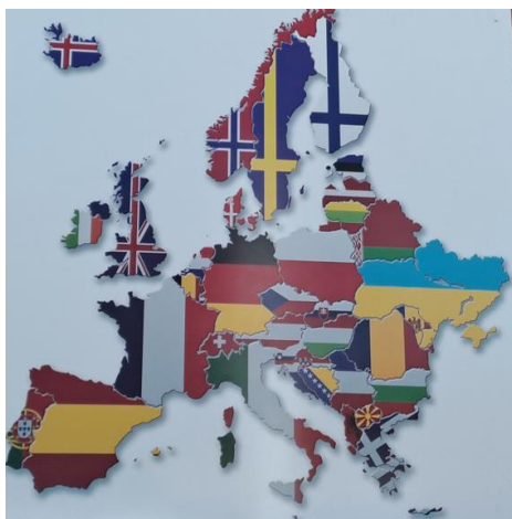
A map on the wall of a school.